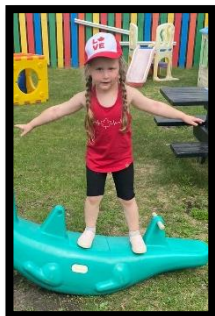
Canada Day Celebrations